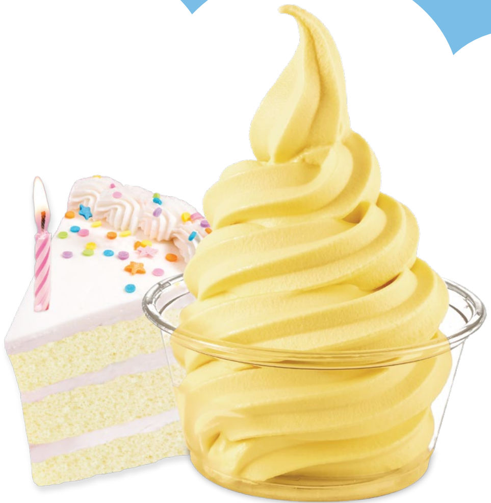
Frostline® Birthday Cake Flavored Soft Serve Mix, Artificially Flavored Mfr Product Code D493-C4000 • DOT Code 729574

Order Frostline® Birthday Cake Flavored Soft Serve Mix, Artificially Flavored to enhance your guests dining experience and operational profitability. Contact Kent Precision Foods Group Customer Service at 800-442-5242